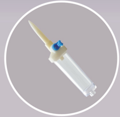
Air vent with bacteria retentive filter with cap