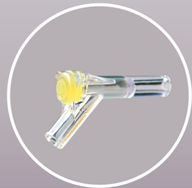
Latex free Y injection port for extra medication.